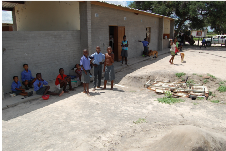
Pupils sitting on the ground in the shade eating.

The children's staple food is maize porridge, three times a day, provided by the government food programme. This is sometimes supplemented by tinned fish. The food is cooked in large pots on open fires and then served to the children in any receptacle that the child owns. Sometimes it is just a large margarine tub. The children then find somewhere to sit on the ground to eat their meal.