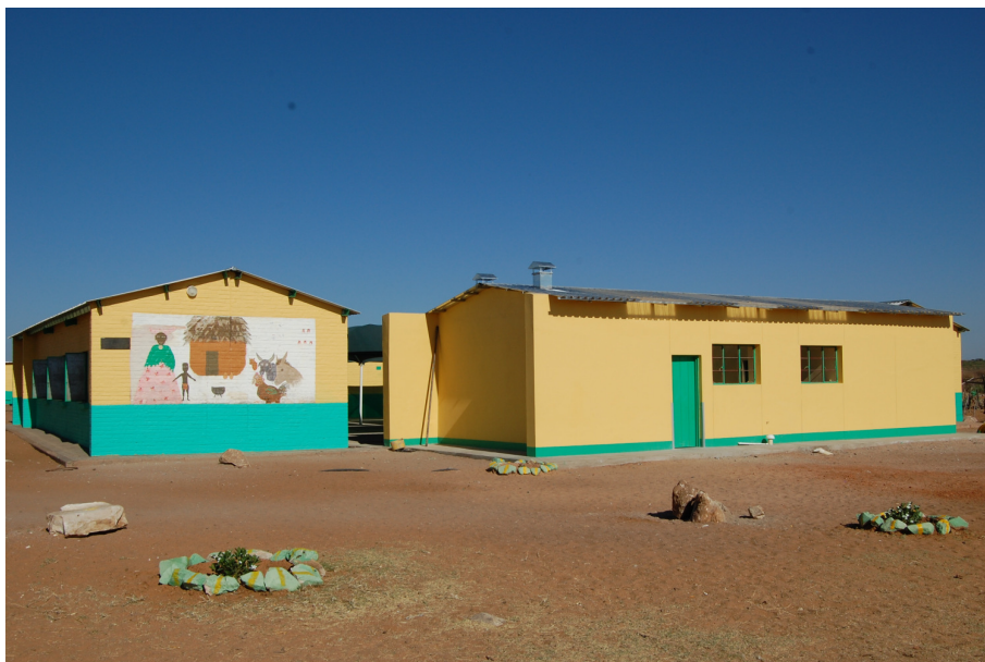
View of the back of the completed kitchen forming the fourth side of the quadrangle containing the covered seating area

The facility which cost £66,000 replaces the previous unhygienic method of cooking food in pots outside in an area frequented by domestic and farm animals. The children would then eat their meals around the pots squatting in whatever shade they could find. Individual donations, sponsored events and fundraising by the Foundation's volunteers provided £36,750 while the balance was provided by grants of £10,000 each from the Erach and Roshan Sadri Foundation and the Rooney Foundation, £3,000 from Frinton Rotary Club, £2,500 from the St James's Place Foundation, £750 from The Enid Slater Charitable Trust, £2,000 from the J Murray Napier Fund and £1,000 from N.Smith Charitable Settlement.