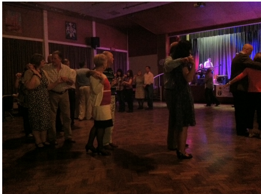
The Ceilidh is full swing!!