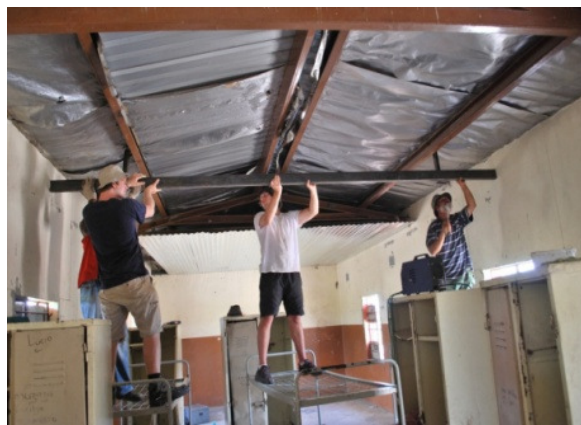
German volunteers from 'Homes of Hope 2011' charity decorating one of the dormitories earlier this year.

Boy's dormitory accommodates 52 boys. There are eleven bunk beds giving 22 beds. As with the girls, they either sleep two to a bed or on the floor. Most beds and lockers are damaged. The building is in similar condition to the girls.