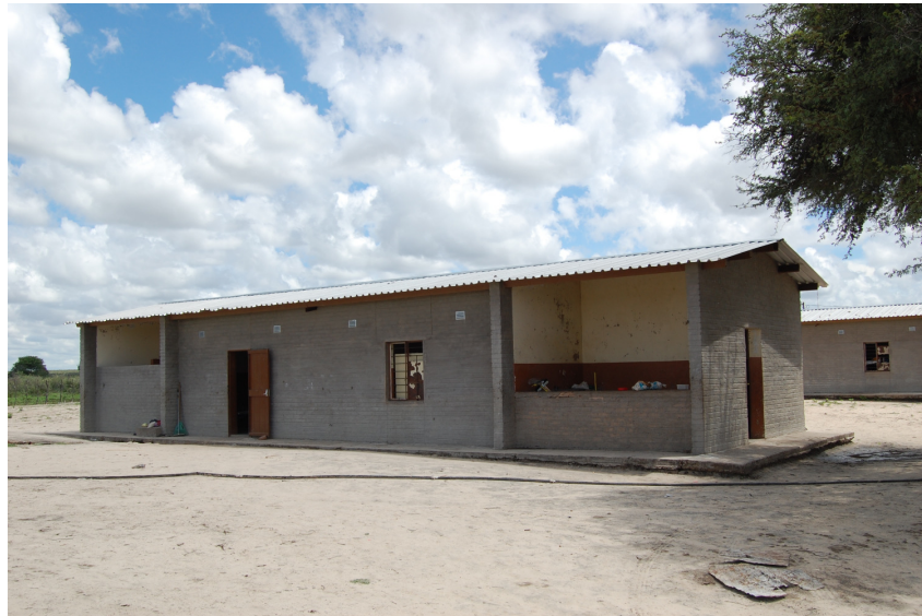
General view of the hostel buildings. The girl's dormitory is nearest the camera with the boy's dormitory in the background.

Eiseb was originally a San bushman settlement and after Namibia became independent in 1990 the government encouraged Herero cattle farmers to return from exile in Botswana and settle there. It is situated in the bush towards the Botswana border, 260 miles north east of Gobabis, the regional capital and is served by a gravel road for the majority of the distance. Facilities are sparse but as well as the school and hostel there is a medical clinic staffed by one nurse.